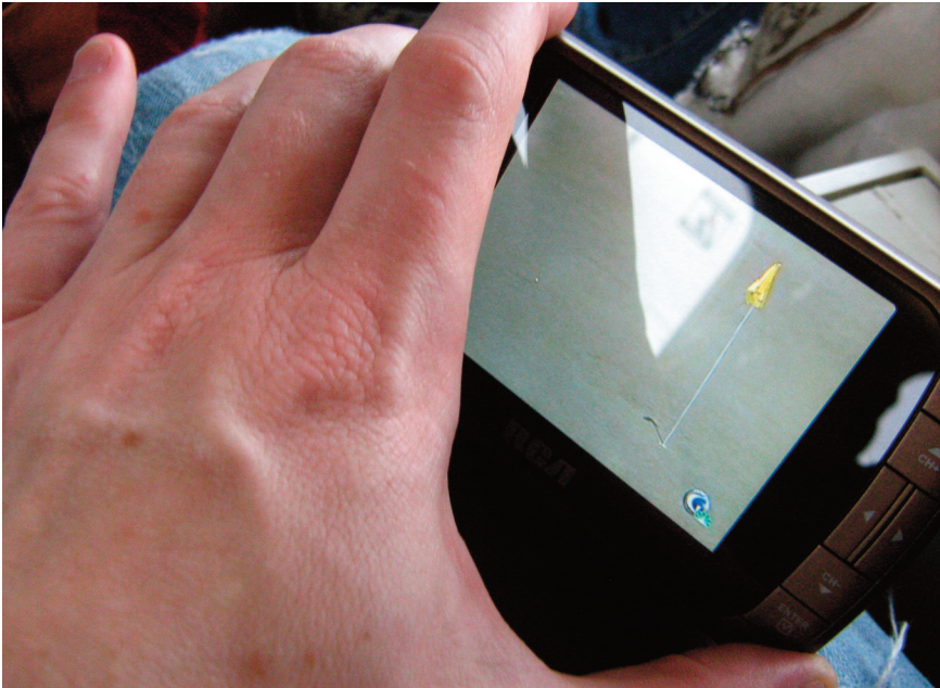
Figure 2: Viewing a MDTV broadcast on a moving train